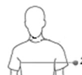
2- Measure the broadest part of your chest